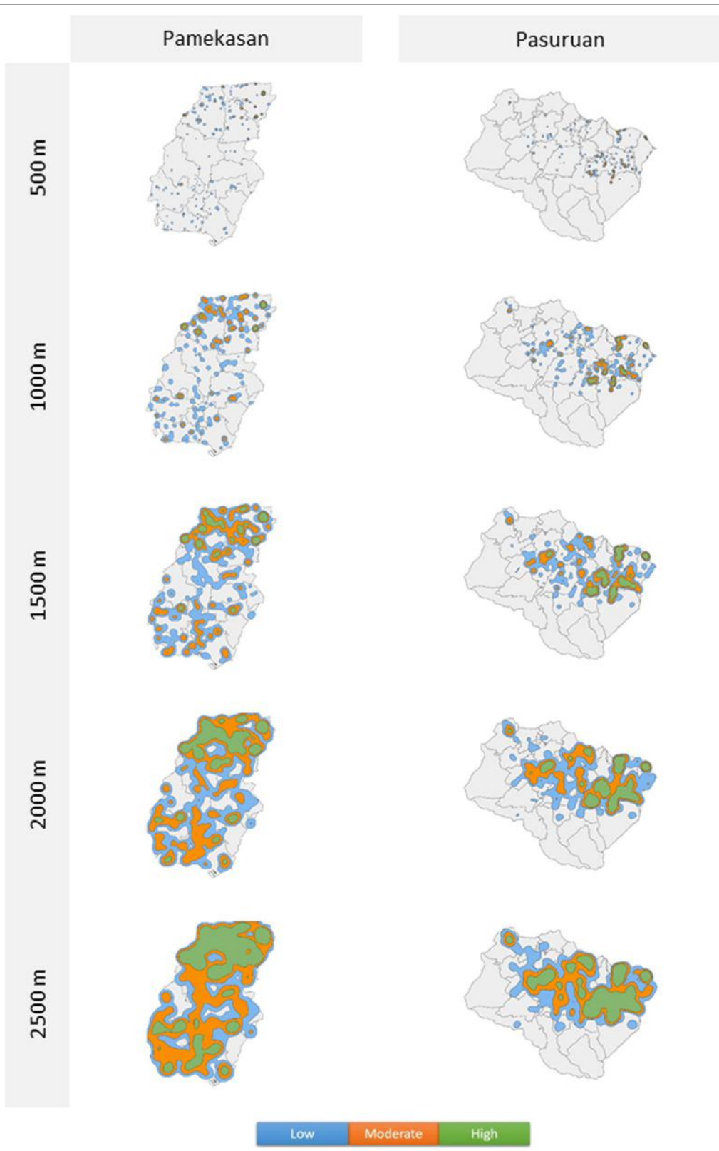
Fig. 2 Clusters in Pamekasan and Pasuruan by heatmap radius and cluster density. Cluster maps of Pamekasan (left) and Pasuruan (right) by heatmap radius and cluster density. Heatmap radius varies from 500 m (top row) to 2500 m (bottom row). The blue colour represents low density clusters ( \geq 2 ), the orange colour represents moderate density clusters ( \geq 5 ), and the green colour represents high density clusters ( \geq 10 )